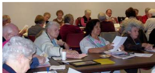
ALTC Advisory Council meeting

See the Appendices for documentation of forums, Advisory Council membership and public hearings.